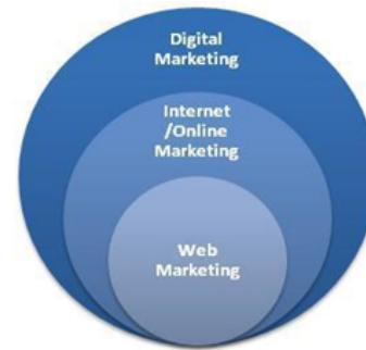
Figure 1: Digital Marketing, Internet Marketing, and Web Marketing :

These definitions can be summarized as follows: